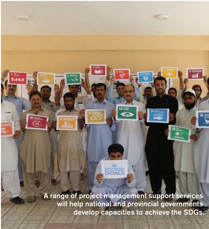
A range of project management support services will help national and provincial governments develop capacities to achieve the SDGs.

dations, and manages follow-up action plans. Officials have shown keen interest in learning from other countries, and are considering a learning alliance between Punjab's Planning and