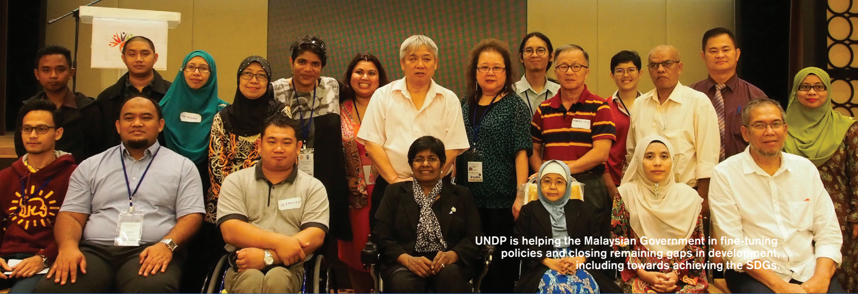
UNDP is helping the Malaysian Government in fine-tuning policies and closing remaining gaps in development, including towards achieving the SDGs.