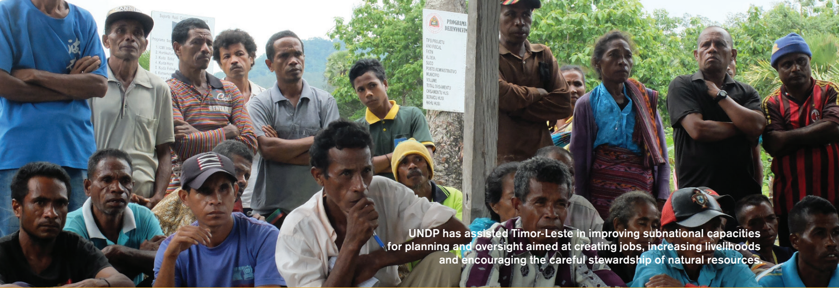
UNDP has assisted Timor-Leste in improving subnational capacities for planning and oversight aimed at creating jobs, increasing livelihoods and encouraging the careful stewardship of natural resources.