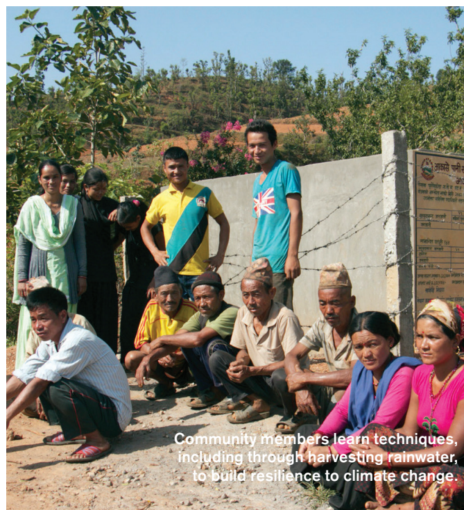
Community members learn techniques, including through harvesting rainwater, to build resilience to climate change.

Establishing the National Climate Change Support Programme at the local level was relatively straightforward, given UNDP's long experience and networks in localities. It built on previous systems for local energy planning established under the Rural Energy Development Programme, implemented over 15 years with the Government, local bodies and com-