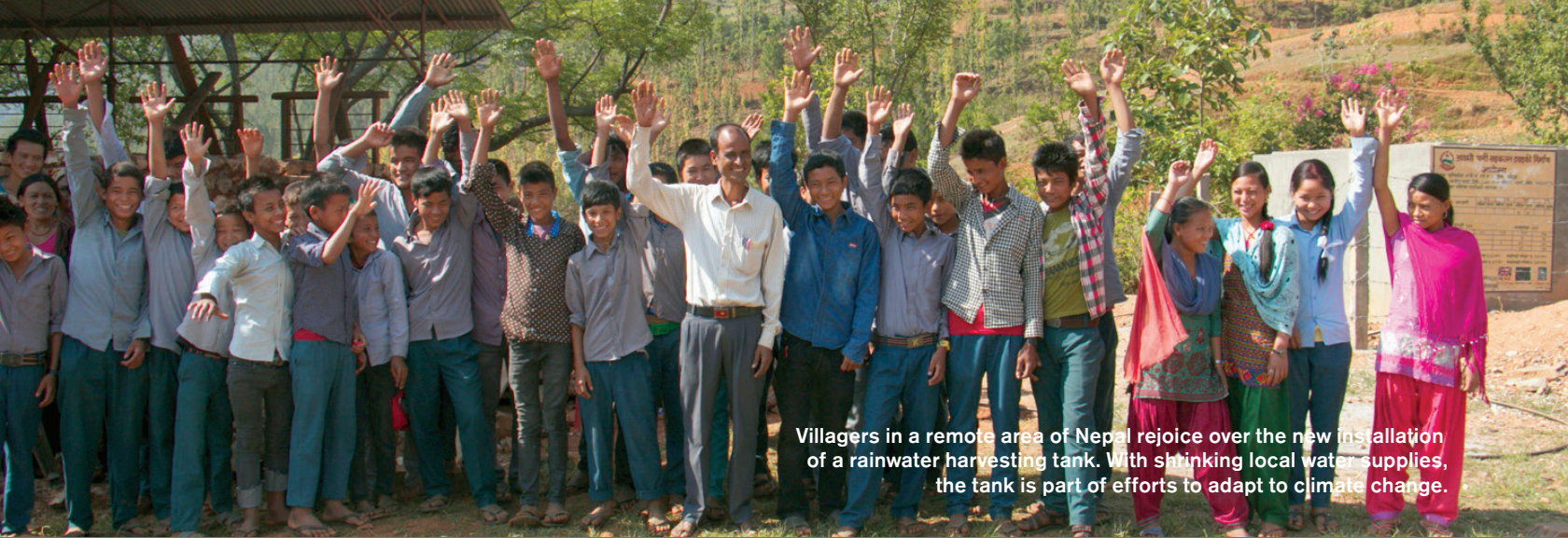
Villagers in a remote area of Nepal rejoice over the new installation of a rainwater harvesting tank. With shrinking local water supplies, the tank is part of efforts to adapt to climate change.