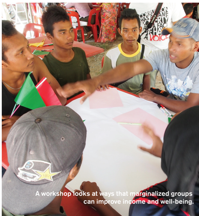
A workshop looks at ways that marginalized groups can improve income and well-being.

In helping to guide the dialogue process, UNDP will draw on leading academic and other experts. Some will advise on the most strategic use of open space forums, while others will reinforce a move towards a more inclusive focus on the multiple dimensions of poverty, since the longstanding classification of the bottom 40 percent rests on income alone.