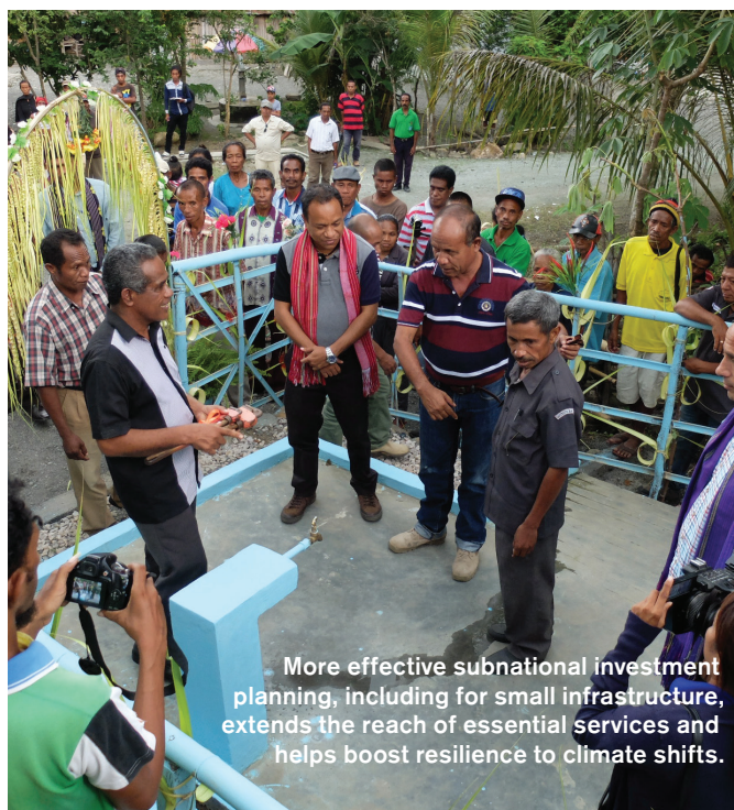
More effective subnational investment planning, including for small infrastructure, extends the reach of essential services and helps boost resilience to climate shifts.

UNDP has provided a diagnostic methodology and tools on institutional strengthening as well as training to the Secretary of State for Institutional Strengthening and nine line ministries. This helped shape the recently adopted Policy for Strengthening Institutions (2016-2030), accompanied by a mechanism to monitor implementation. In six municipalities, a foundation course on policy, strategy, leadership and management has informed civil servants about the national development vision and how they can contribute through