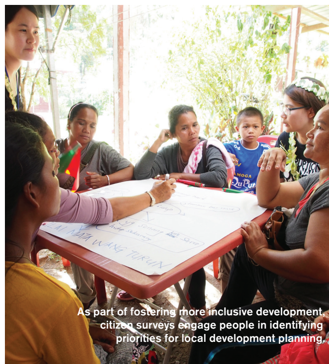
As part of fostering more inclusive development, citizen surveys engage people in identifying priorities for local development planning.

As an example of how service provision will work, the Economic Planning Unit and UNDP will be developing a