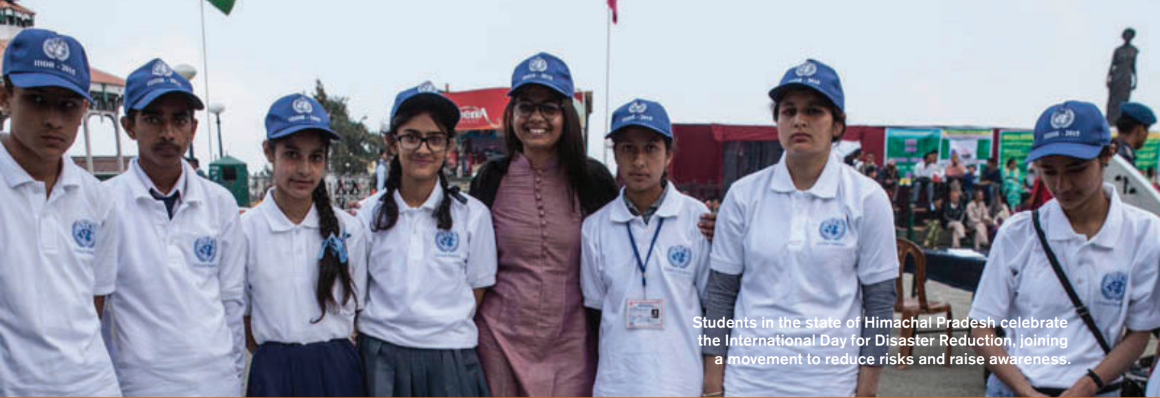
Students in the state of Himachal Pradesh celebrate the International Day for Disaster Reduction, joining a movement to reduce risks and raise awareness.